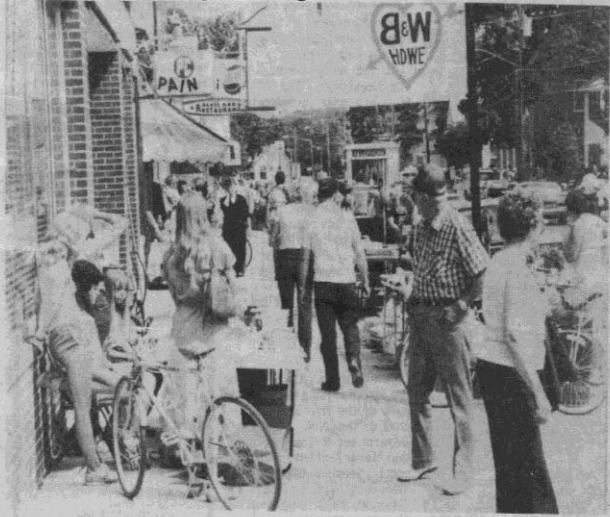
MAIN STREET was crowded with people looking for bargains.