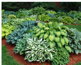
Hosta (Plantain Lily)

Enjoy a special spot to reflect, meditate, or just be close to nature at the Stone Labyrinth Reflection Area, completed by Schoharie's three churches in May 2016.